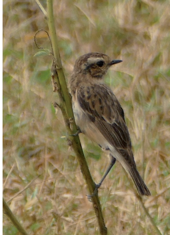
Whinchat in Udawalawe National Park, Sri Lanka, 08 February 2015 (Photos: © Klemens STEIOF).