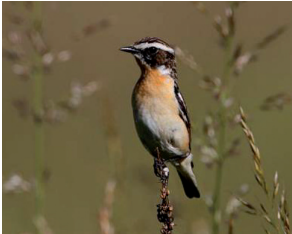
Whinchat near Matting, county of Regensburg, Bavaria, Germany, 2014.