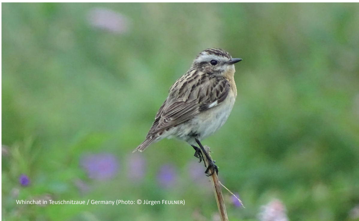
Whinchat in Teuschnitzaue / Germany

Aus diesem Grund erscheint das Ausweiten der vorhandenen Säume zu breiten Brachestreifen als eine zielführende Schutzmaßnahme für Braunkehlchen, um geeignete Strukturen zur Nestanlage sowie ein gutes Nahrungsangebot in direkter Nestumgebung