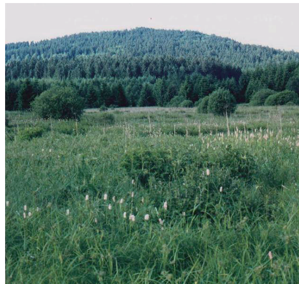
In 1998/99 Whinchats preferred fallow land as breeding habitat in the Bavarian Forest. (Photo: © Richard SCHLEMMER).

Über die restliche Krautschicht hinausragende Hochstaudenstängel begünstigen den Bruterfolg. Dichter Gebüschbewuchs beeinflusst diesen negativ. Einzelne Büsche können die Habitataignung jedoch insbesondere von Mähwiesen steigern. Zum Waldrand wird bei Wiesen und Weiden in der Regel ein Mindestabstand von 100 Metern eingehalten. Die für Braunkehlchen attraktiveren Wiesenbrachen wurden jedoch auch besiedelt, wenn ihr Abstand zum Waldrand nur zwischen 50 und 100 Meter betrug.